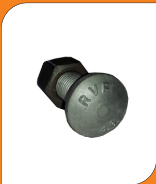
ROAD CRASH BARRIES