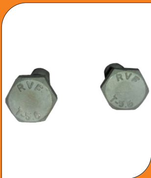
ROAD CRASH BARRIES