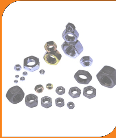
HOT DIP GALVANIZED NUTS