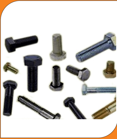
HIGH TENSILE BOLTS