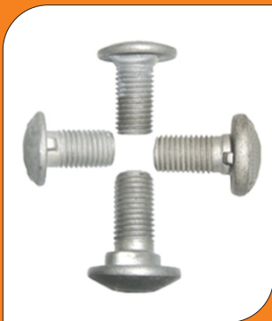
ROAD CRASH BARRIES