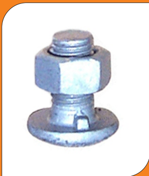
ROAD CRASH BARRIES